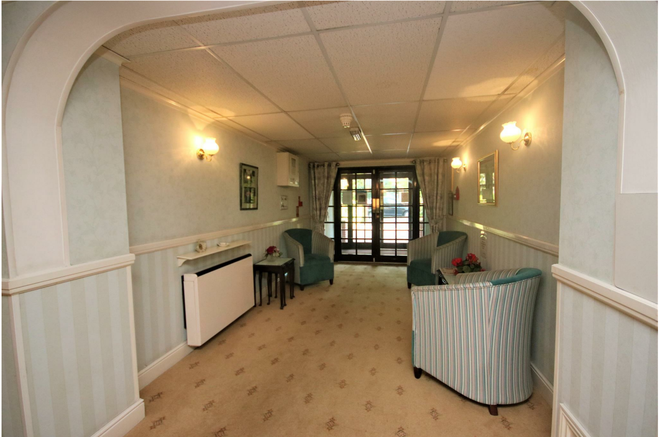
COMMUNAL RECEPTION ROOM: PIC. 1