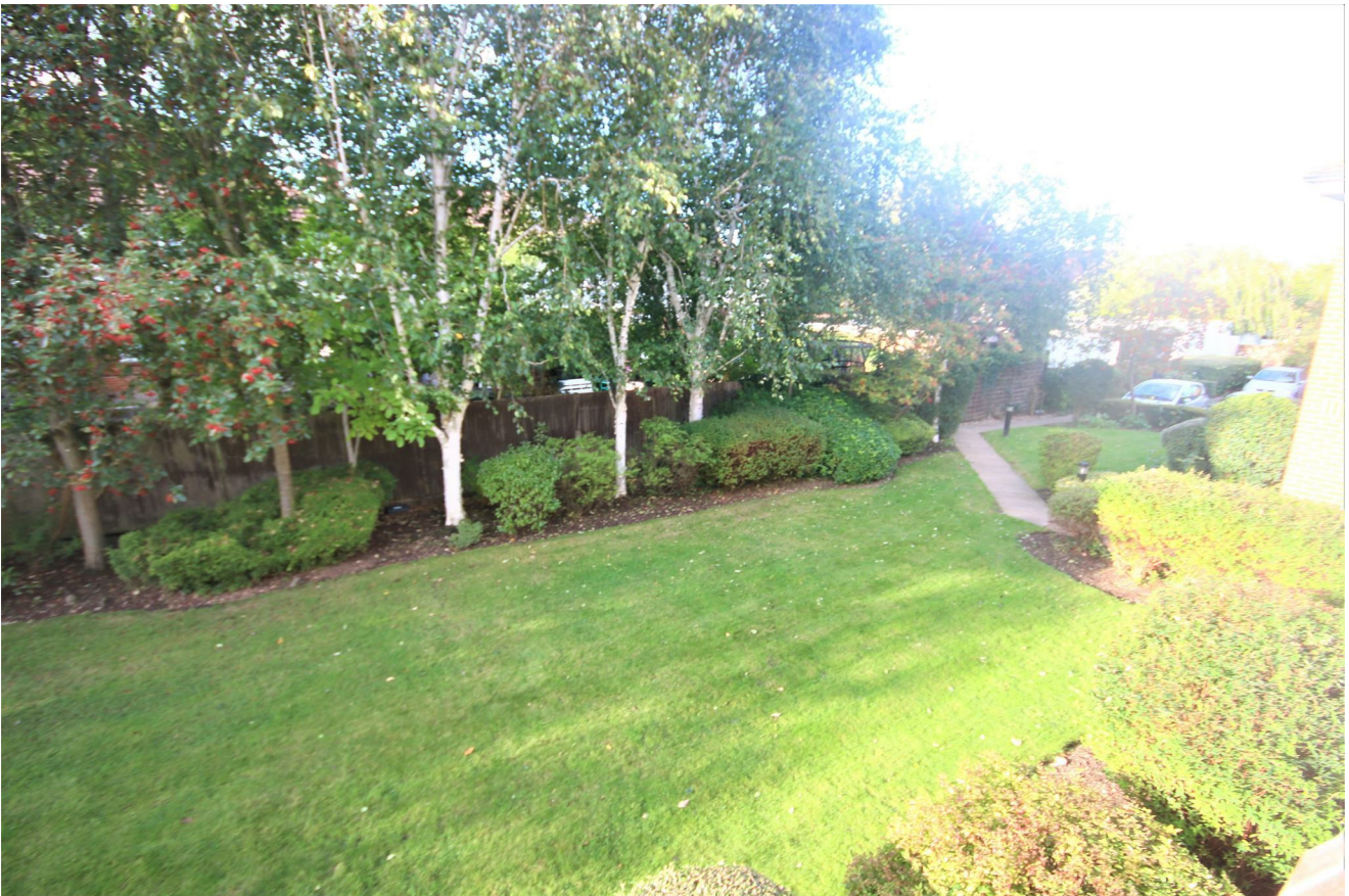
VIEWS TO REAR OVER COMMUNAL GARDENS: