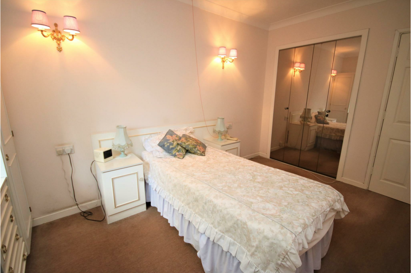
OWN FLAT: BATHROOM