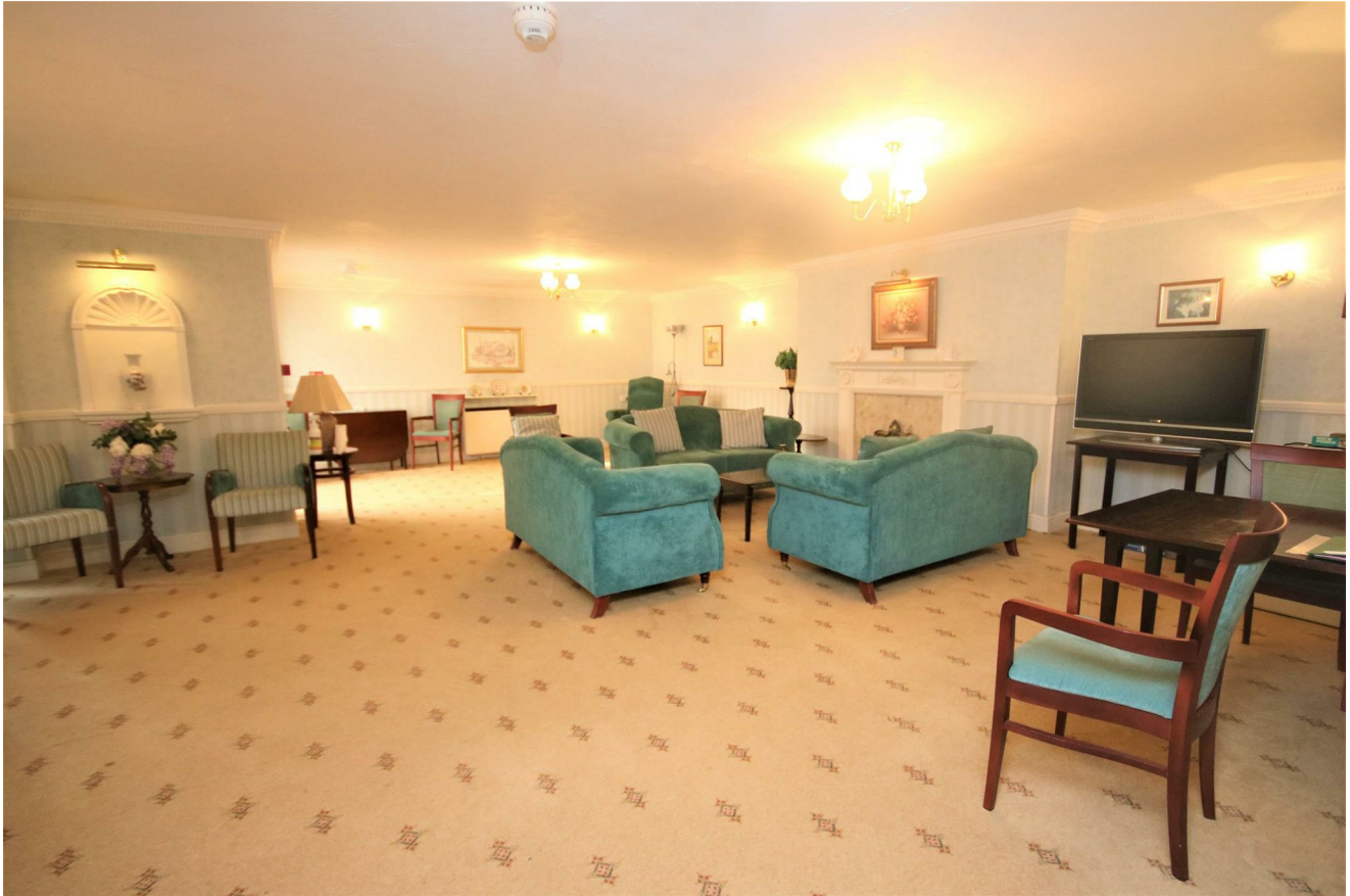
COMMUNAL DOUBLE GLAZED CONSERVATORY: